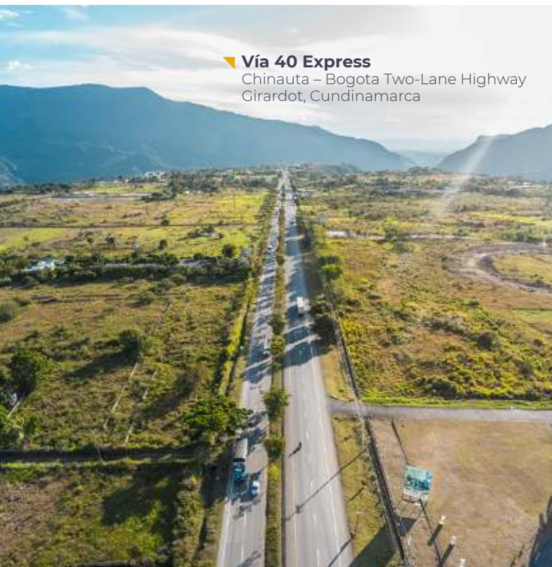
▼ Vía 40 Express Chinauta – Bogota Two-Lane Highway Girardot, Cundinamarca

We have developed capabilities, which allow us to generate value for our related audiences, from the understanding of their needs and our commitment to inspiring a sustainable future.